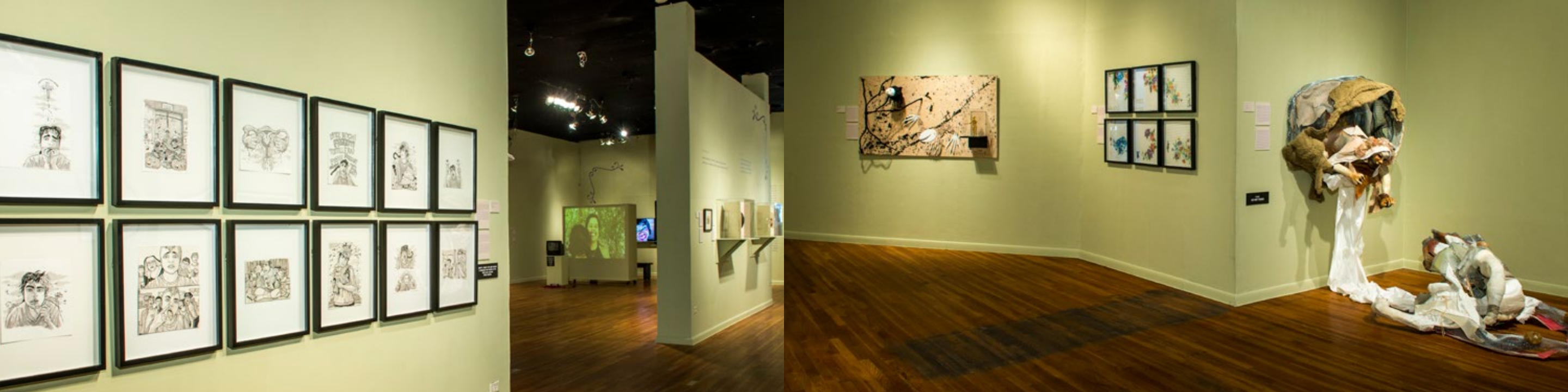
Gallery view of YLA Y, Qué? (previous, current and next page)