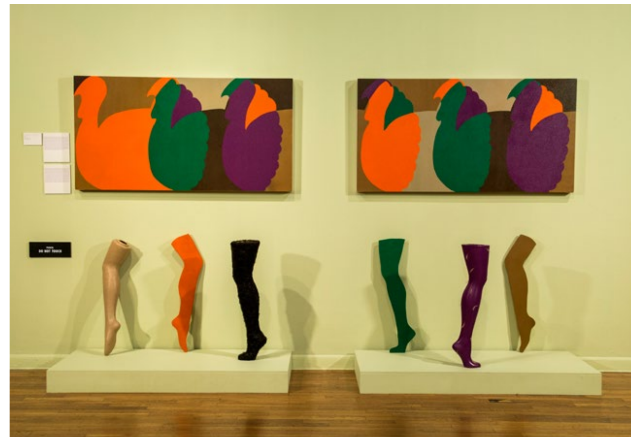
Suzy Gonzalez (Providence, Rhode Island) Miss Drumstick 2013 mixed media dimensions variable

ing, and socially acceptable performative gender roles.